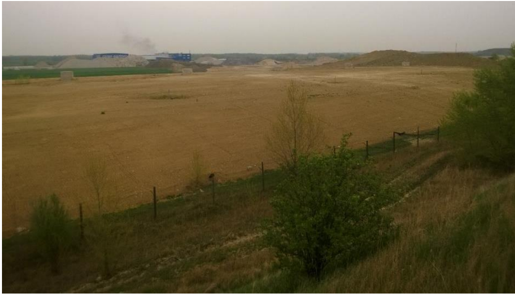
Completed top cover before plantation of grass