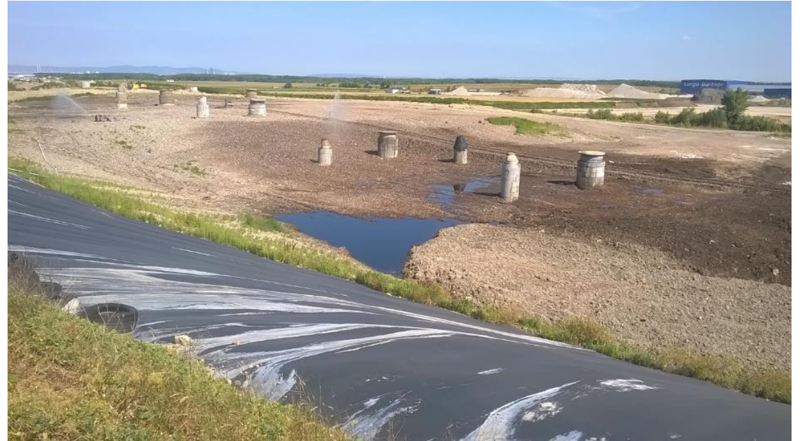
Spraying of pre-treated leachate for reduction of dust and leachate volume by evaporation