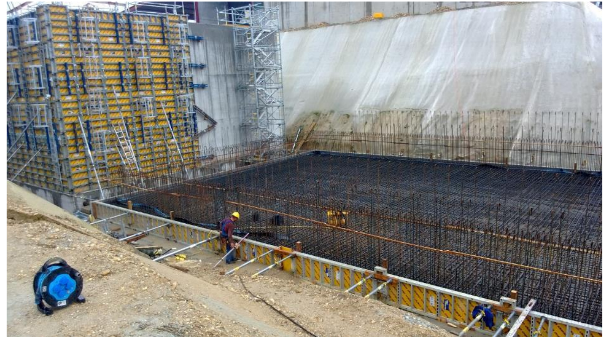
Construction works for the leachate collection basins