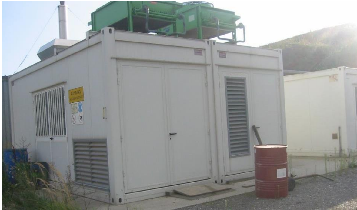
Container with gas engines for power generation