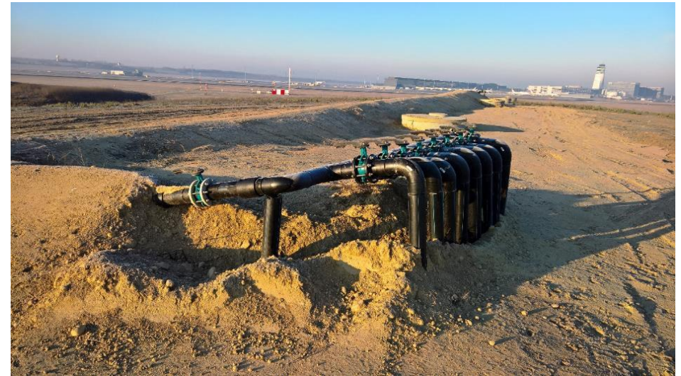
Controlled collection and measuring of landfill-gas