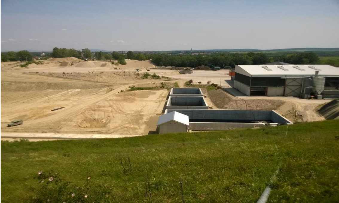
Completed separate leachate collection basins