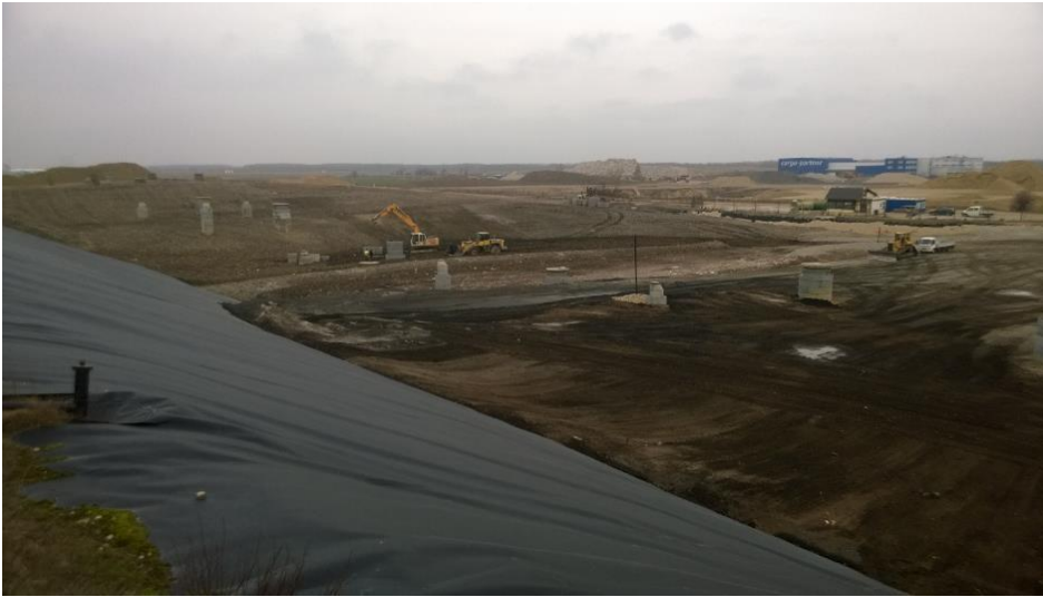
Compartment for landfill type for ordinary waste