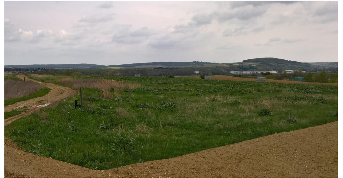
View of closed landfill vegetation of grass and gas-wells