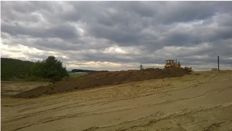
Completion of top cover with a layer of natural soil