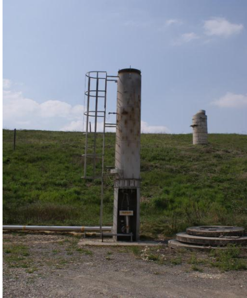
Gas flare for emergency situation