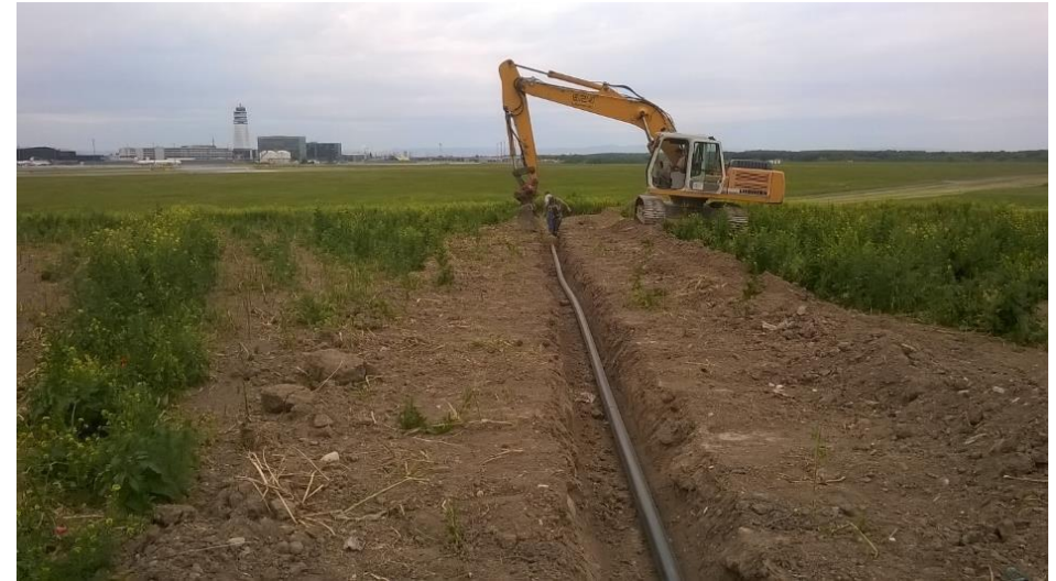
Construction of pipeline for gas collecting system