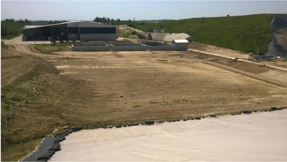
Construction of a combined sealing